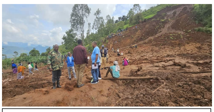
Landslide affected area in Kencho Gozdi, Gofa Zone, South Ethiopia Region. 24 July 2024.

The Regional Disaster Risk Management Commission (DRMC) has provided non-food item (NFI) kits to 130 people and supplementary food assistance to over 850 people. The Ethiopian Red Cross Society (ERCS) has distributed NFI kits, including jerry cans, soap, and other essential items to 127 individuals. The EDRMC has sent an initial supply of food amorganey sholter and non-food.